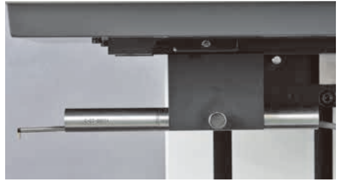
Roughness measuring detector (option)

In case roughness measurement capability is required following installation, the system can be upgraded to a multi-functional contour and roughness measurement system simply by adding a roughness detector and roughness analysis program.